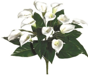
"Springing into newness of life"

Greetings! I just wanted to share a little note with you before the upcoming Spring weekends. Our theme for the Ladies' Weekend is Romans 6:4 "Springing into the newness of life." I don't know about you, but that is so exciting to me and I can not wait to see what God has in store. Jesus is all about new and exciting.